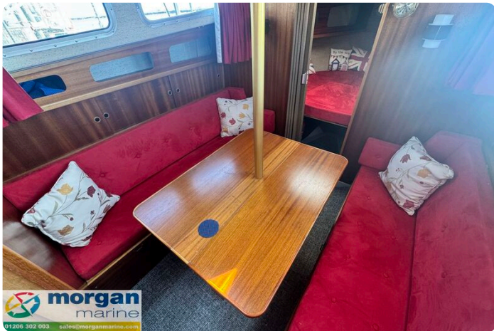
LM 27 Motor Sailer - fold up table