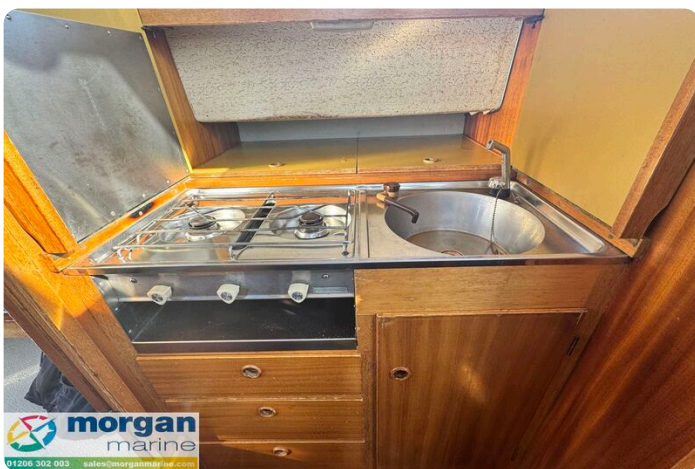
LM 27 Motor Sailer - galley