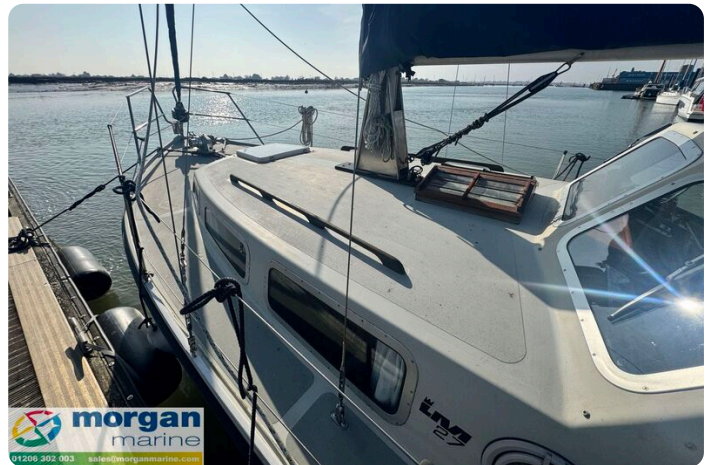
LM 27 Motor Sailer - railings