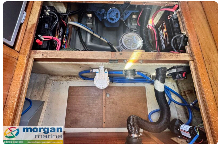
LM 27 Motor Sailer - storage