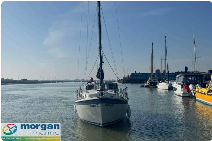
LM 27 Motor Sailer - bow