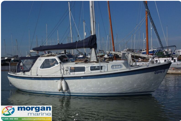
LM 27 Motor Sailer - side view