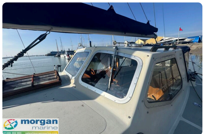
LM 27 Motor Sailer - window