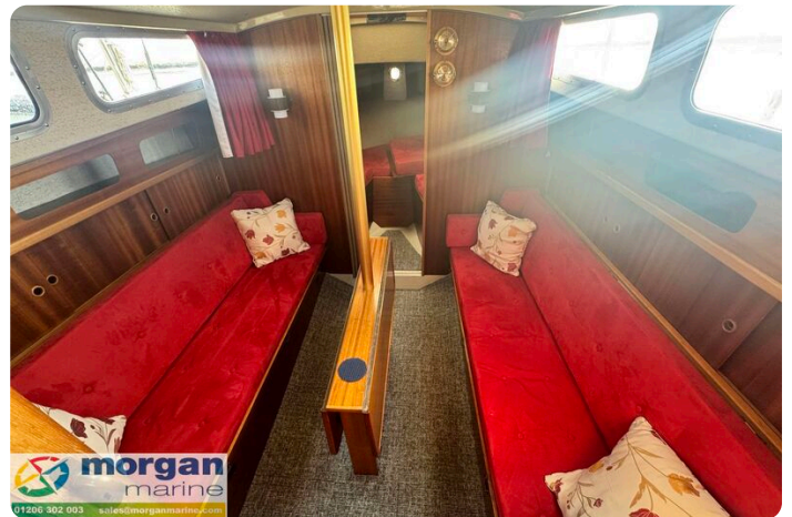
LM 27 Motor Sailer - saloon table