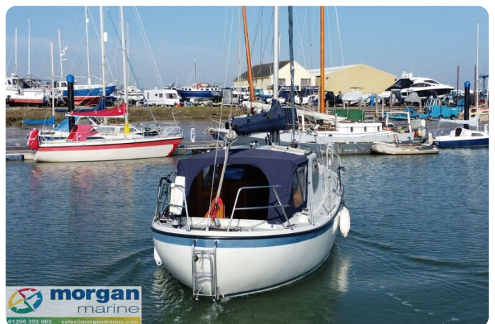
LM 27 Motor Sailer - stern