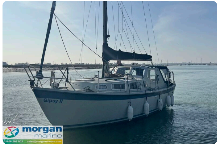
LM 27 Motor Sailer - rails