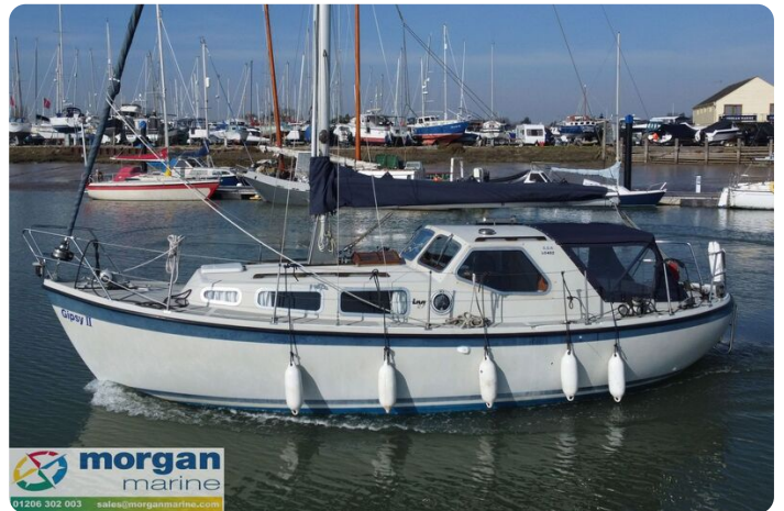
LM 27 Motor Sailer - on water