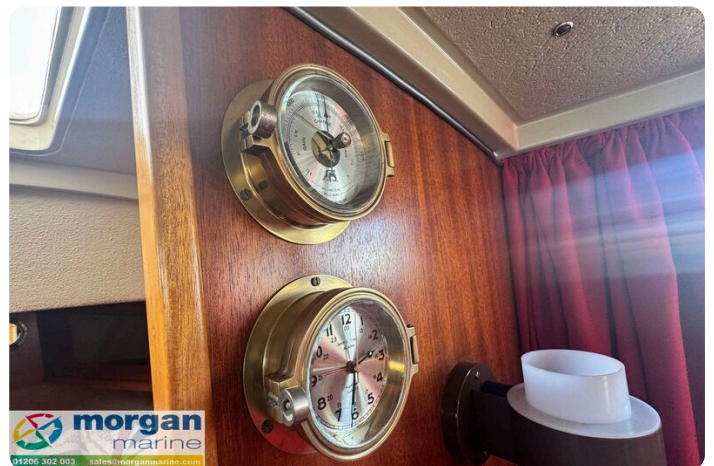
LM 27 Motor Sailer - clocks