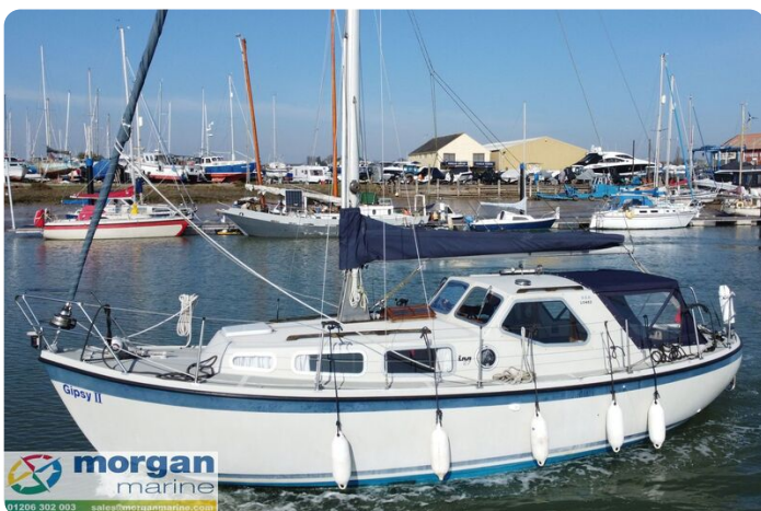
LM 27 Motor Sailer - sail