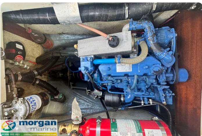
LM 27 Motor Sailer - engine