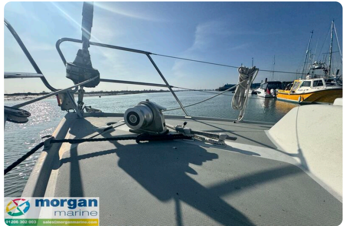
LM 27 Motor Sailer - windlass