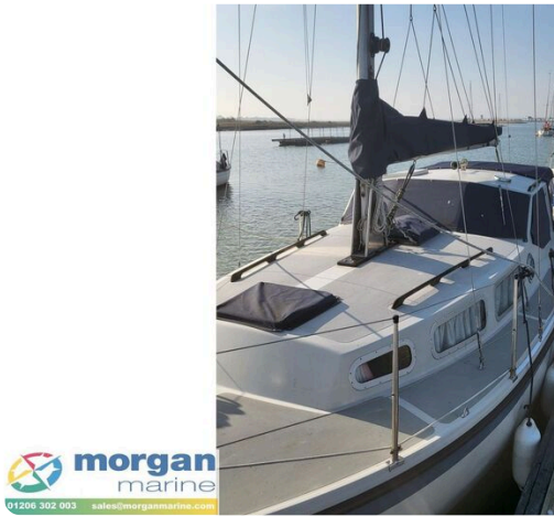
LM 27 Motor Sailer - hatch cover