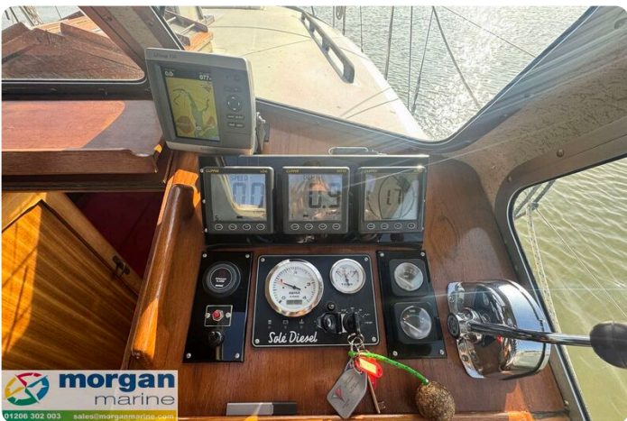
LM 27 Motor Sailer - controls