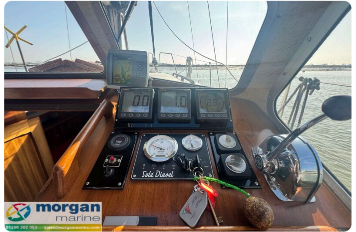
LM 27 Motor Sailer - dash