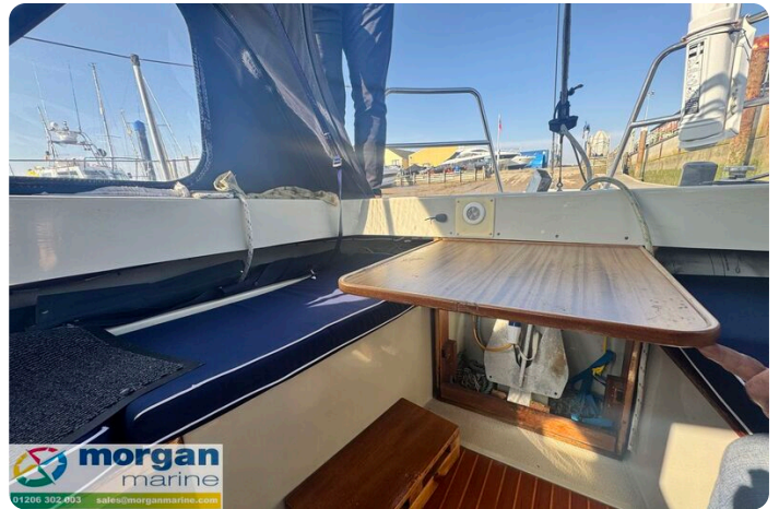
LM 27 Motor Sailer - table