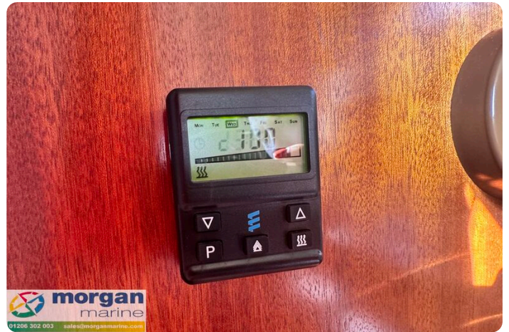
LM 27 Motor Sailer - Heating