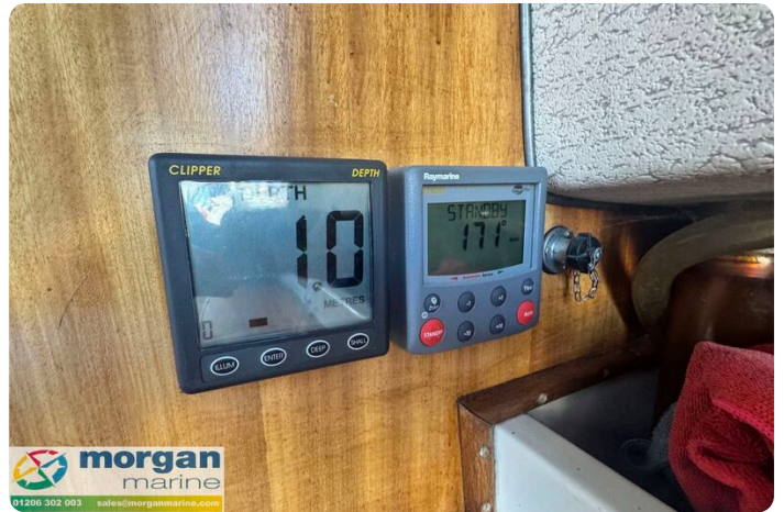
LM 27 Motor Sailer - clipper