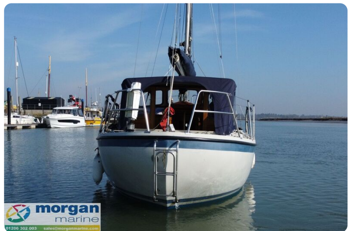
LM 27 Motor Sailer - boarding ladder