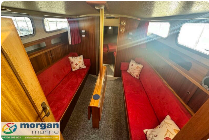
LM 27 Motor Sailer - table