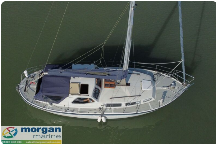
LM 27 Motor Sailer - mast