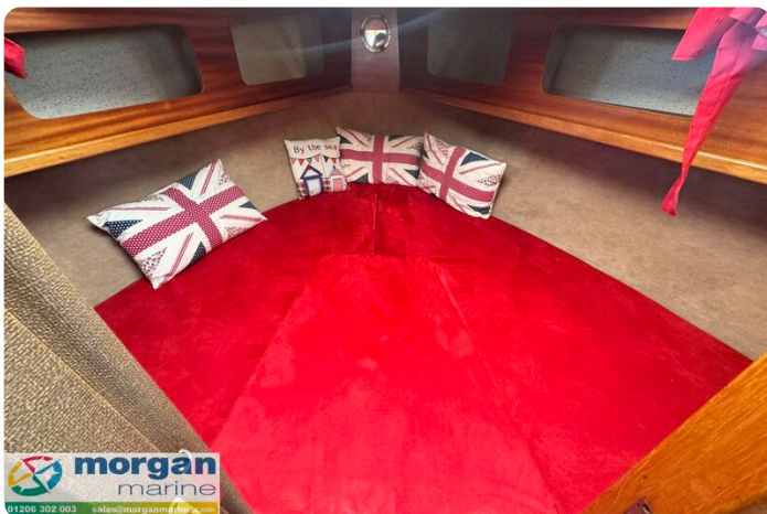
LM 27 Motor Sailer - forward berth