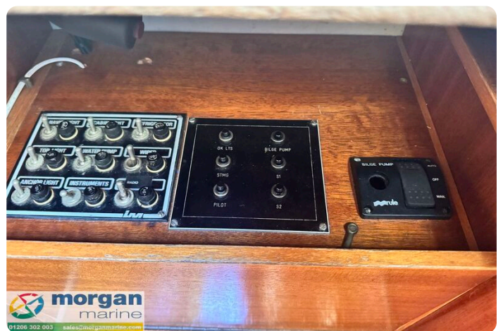
LM 27 Motor Sailer - switch panel