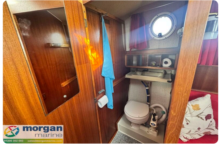
LM 27 Motor Sailer - toliet