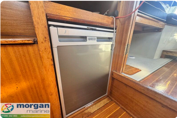
LM 27 Motor Sailer - fridge