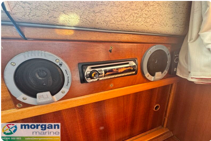
LM 27 Motor Sailer - speakers