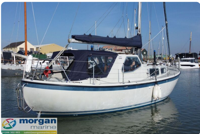
LM 27 Motor Sailer - back