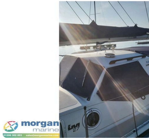
LM 27 Motor Sailer - window covers