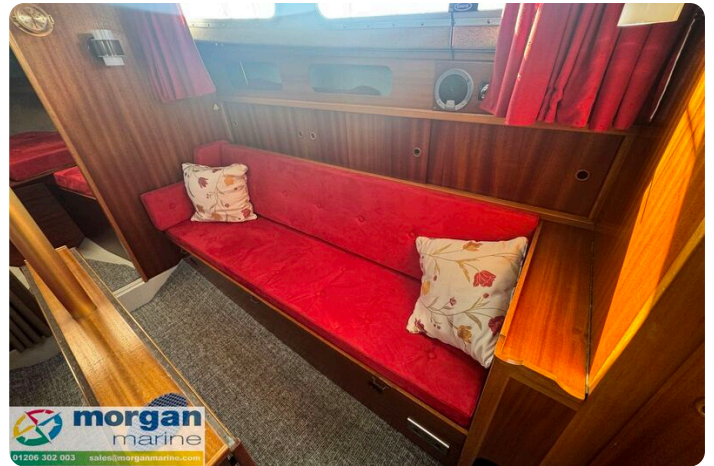
LM 27 Motor Sailer - bench seating