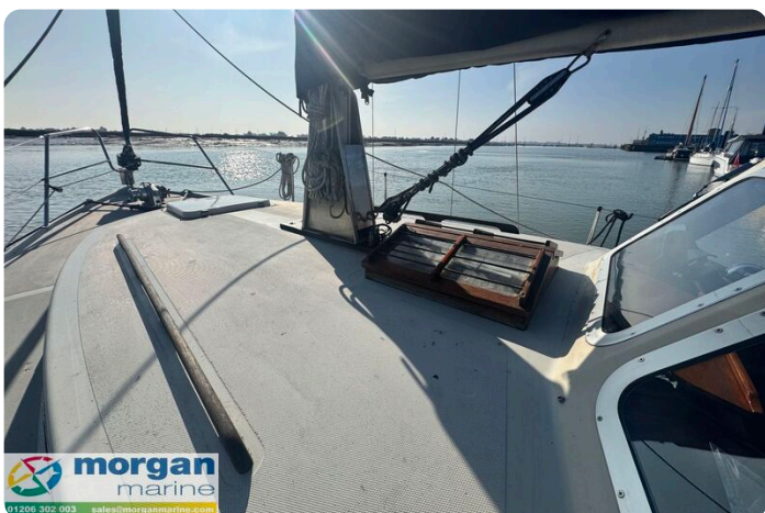
LM 27 Motor Sailer - hatch