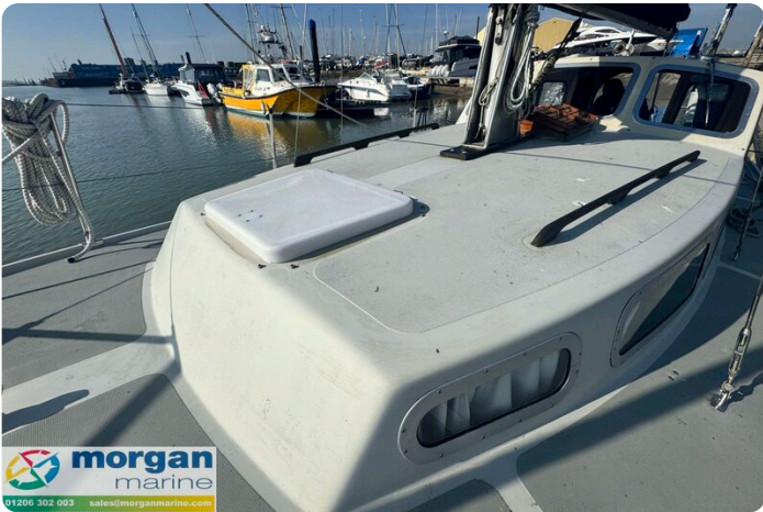
LM 27 Motor Sailer - deck