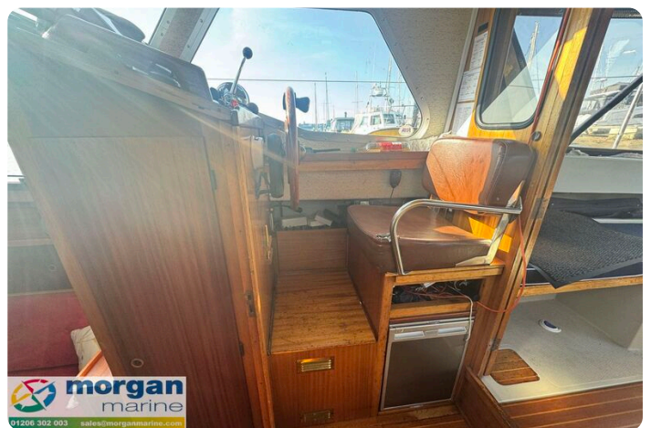
LM 27 Motor Sailer - fridge