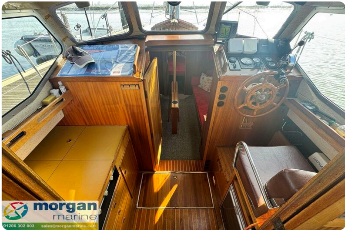
LM 27 Motor Sailer - saloon