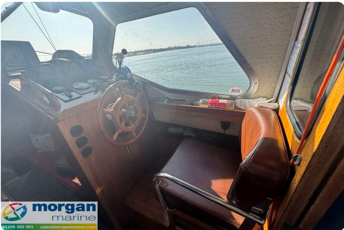
LM 27 Motor Sailer - pilot