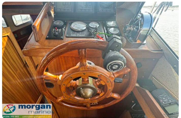
LM 27 Motor Sailer - wheel