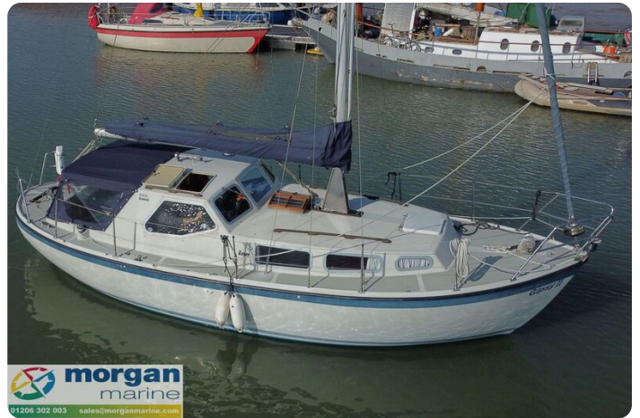
LM 27 Motor Sailer - deck