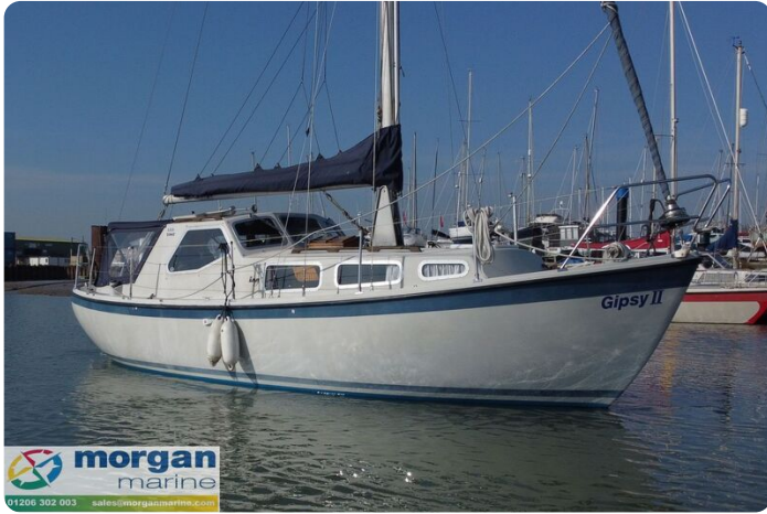
LM 27 Motor Sailer - Main