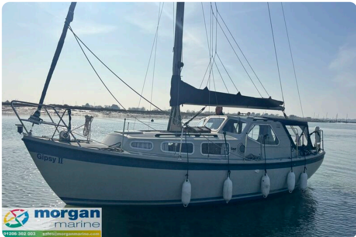
LM 27 Motor Sailer - fender