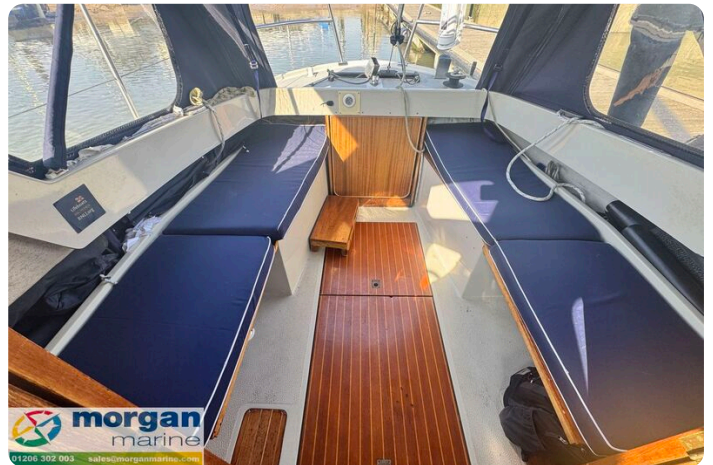
LM 27 Motor Sailer - cockpit