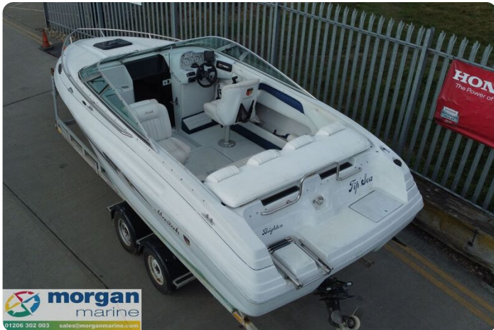
Mariah Shabah 218 - back overview