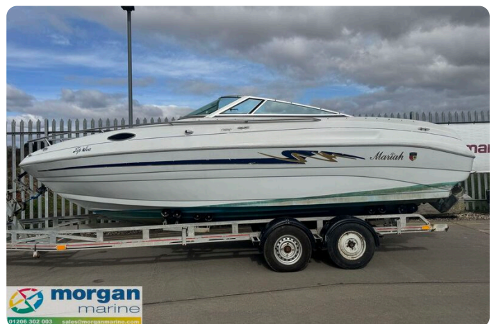
Mariah Shabah 218 - side view