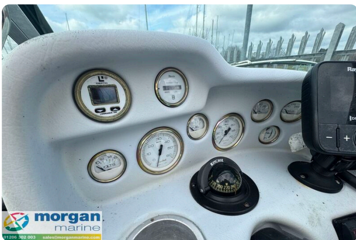
Mariah Shabah 218 - compass