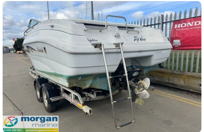
Mariah Shabah 218 - boarding ladder