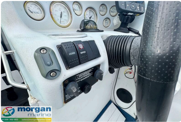
Mariah Shabah 218 - controls