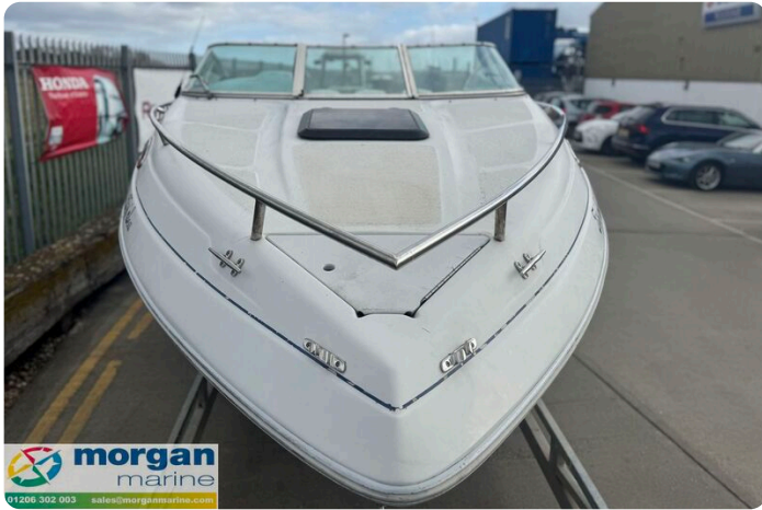
Mariah Shabah 218 - bow