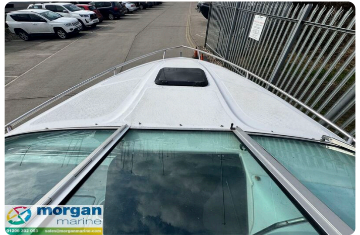
Mariah Shabah 218 - hatch