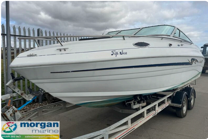
Mariah Shabah 218 - front