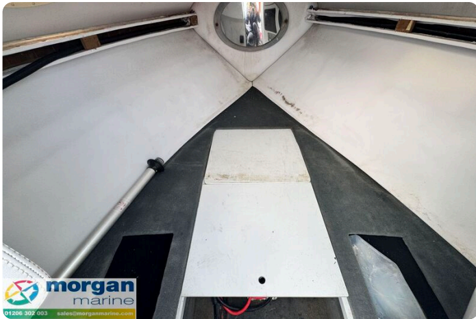
Mariah Shabah 218 - cabin