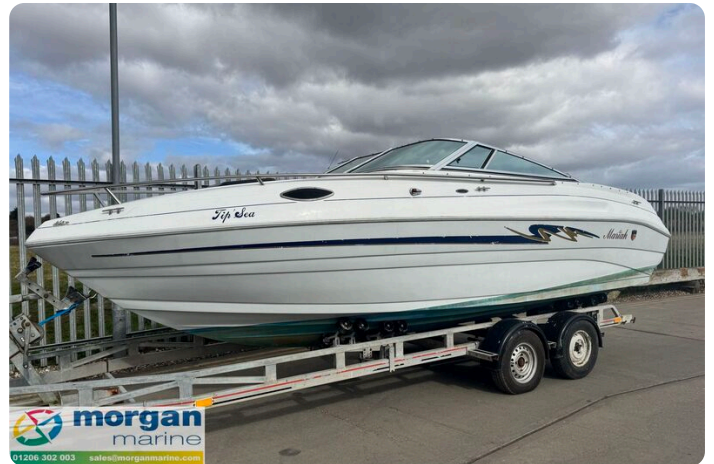
Mariah Shabah 218 - Main