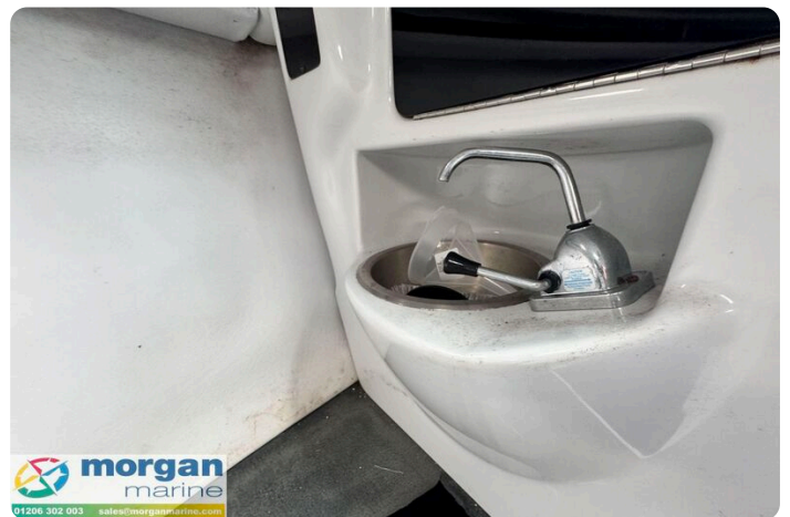
Mariah Shabah 218 - sink