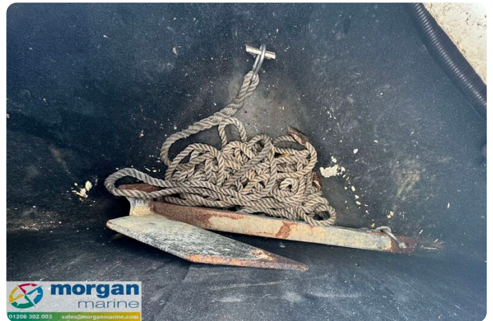
Mariah Shabah 218 - anchor