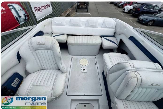
Mariah Shabah 218 - cockpit