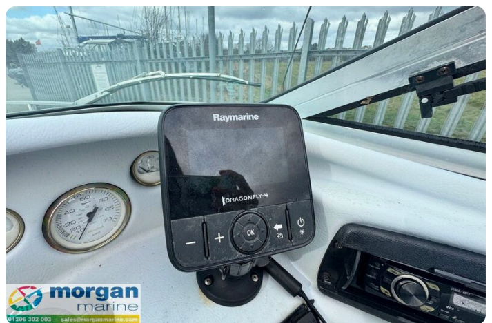
Mariah Shabah 218 - Raymarine