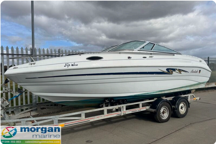
Mariah Shabah 218 - trailer