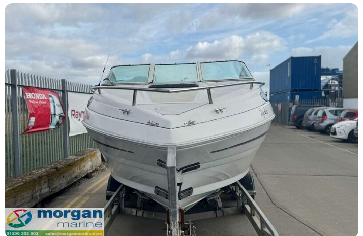
Mariah Shabah 218 - bow view