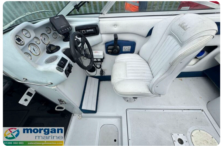
Mariah Shabah 218 - pilot seat