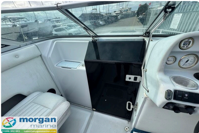
Mariah Shabah 218 - door