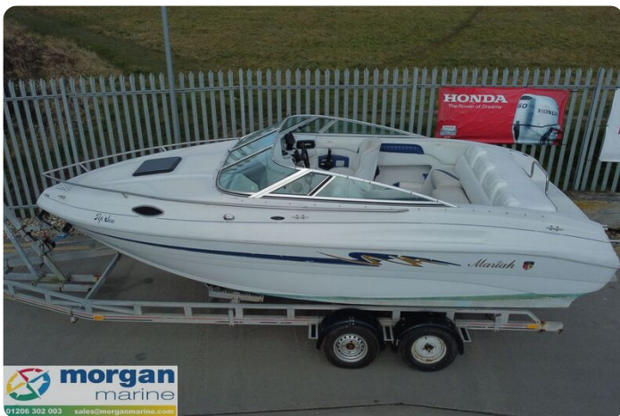
Mariah Shabah 218 - overview