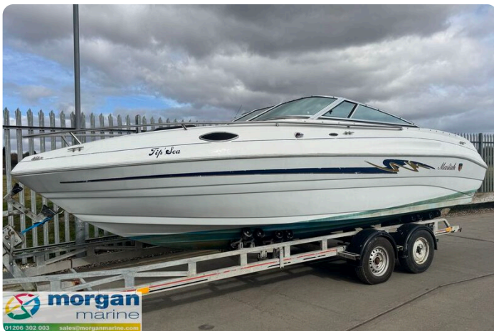
Mariah Shabah 218 - trailer