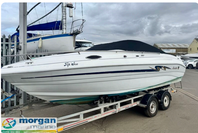
Mariah Shabah 218 - cover