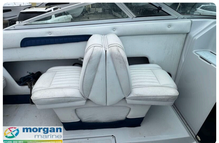
Mariah Shabah 218 - back to back seating