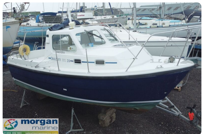
Orkney Day Angler 24 - railings