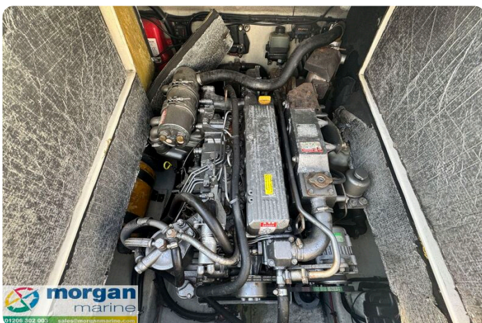
Orkney Day Angler 24 - engine