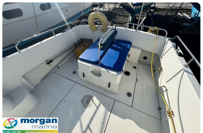
Orkney Day Angler 24 - seating