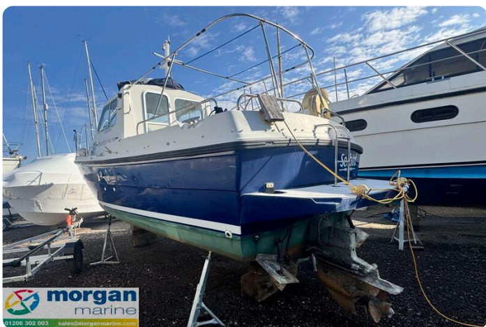
Orkney Day Angler 24 - bracket