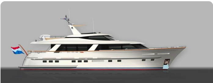
WERNER YACHT DESIGN PACIFIC ALPHA 72