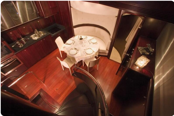
Pacific Prestige 200