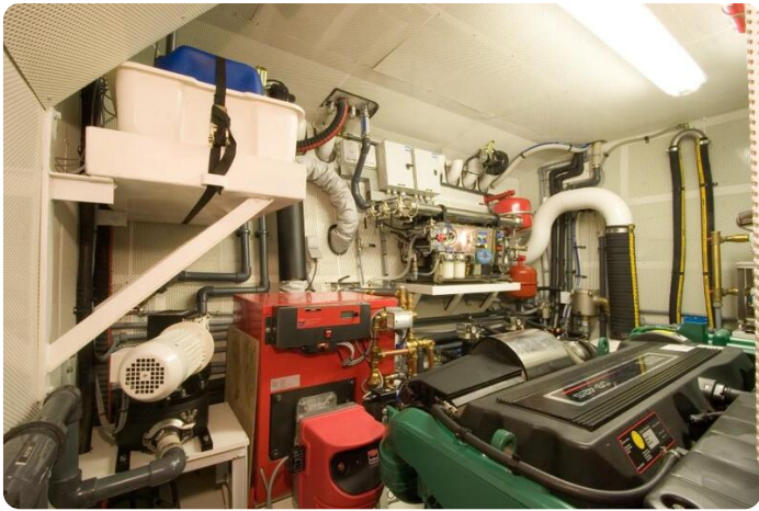
Pacific Prestige 200