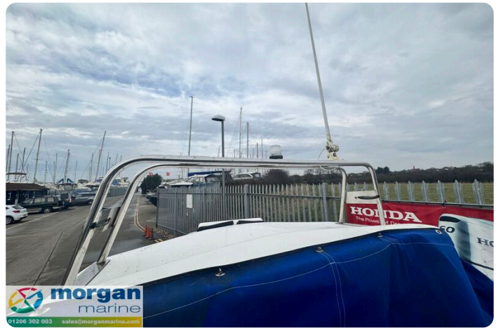
Predator 165 sea angler - arch