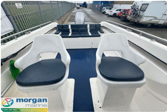
Predator 165 sea angler - pilot