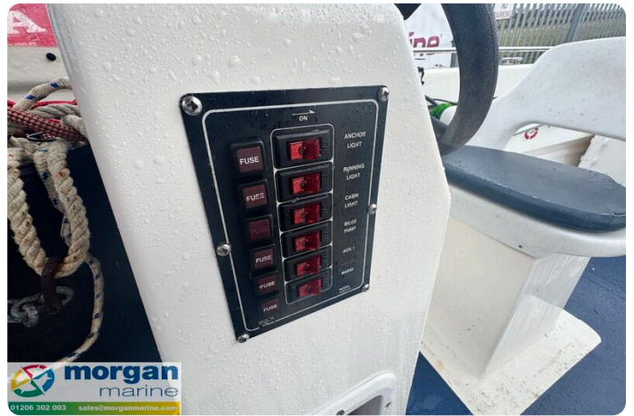
Predator 165 sea angler - Switch panel