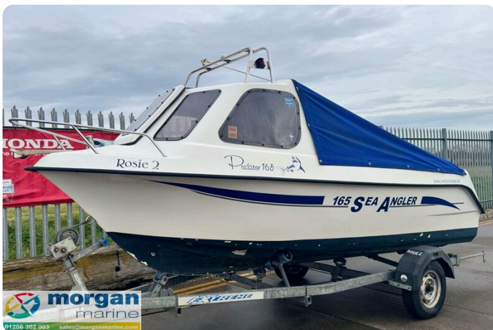
Predator 165 sea angler - main picture