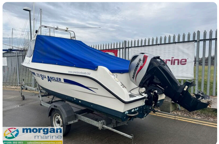
Predator 165 sea angler - mariner engine