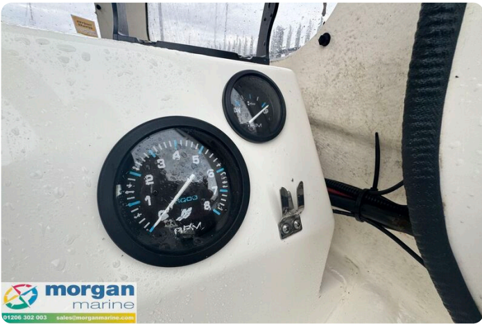
Predator 165 sea angler - gauges