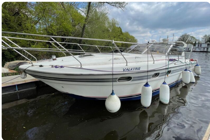
Princess 36 Riviera