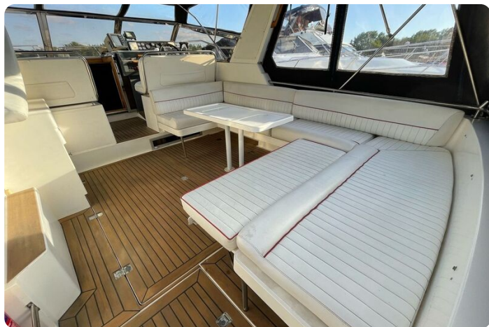
Princess 36 Riviera-Cockpit