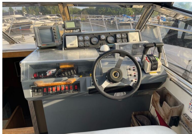
Princess 36 Riviera-dash