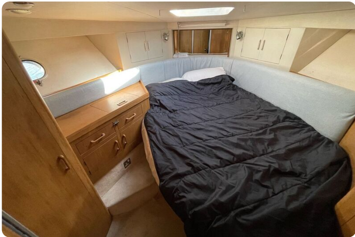
Princess 36 Riviera-berth