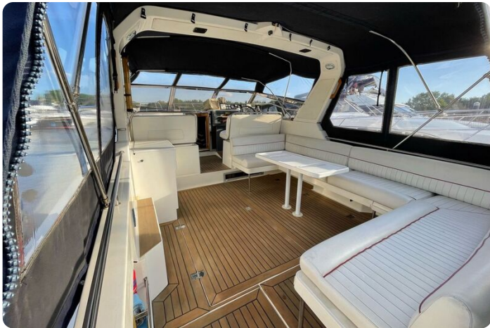
Princess 36 Riviera-cockpit-table