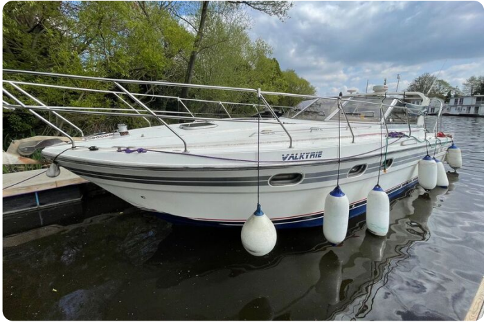
Princess 36 Riviera