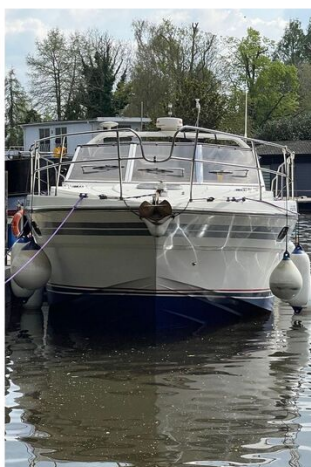
Princess 36 Riviera-front