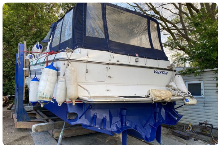
Princess 36 Riviera-back