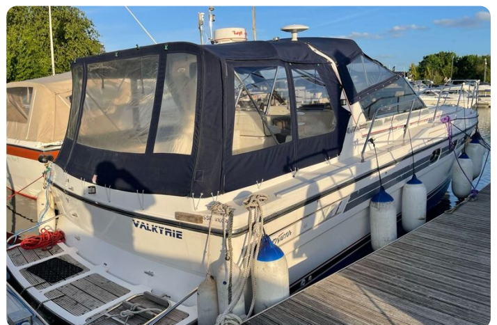
Princess 36 Riviera-back