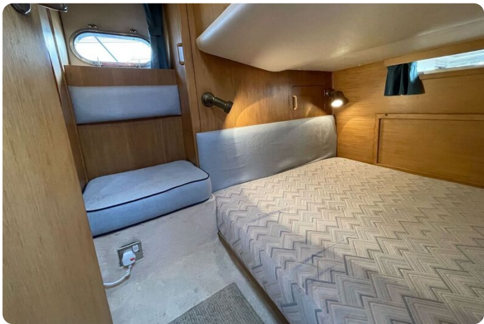
Princess 36 Riviera-aft-berth