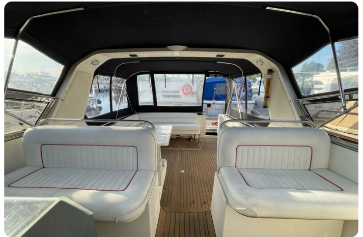
Princess 36 Riviera-overview