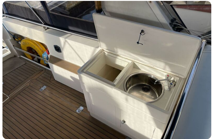
Princess 36 Riviera-cockpit-sink