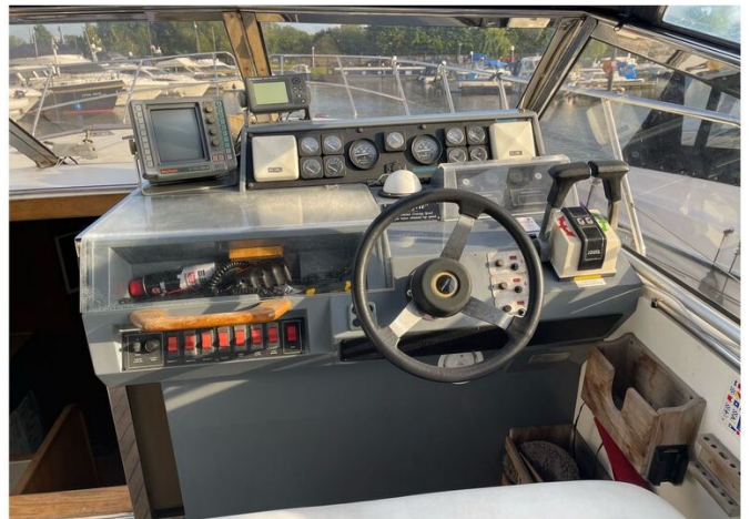
Princess 36 Riviera-dash