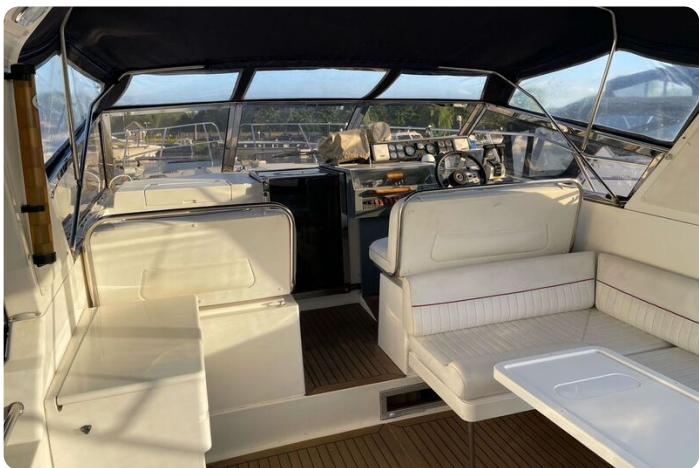
Princess 36 Riviera-cockpit