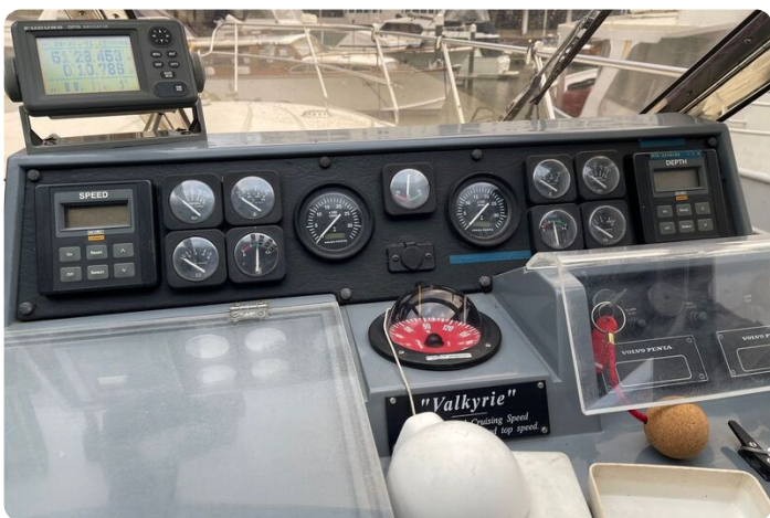
Princess 36 Riviera-dash