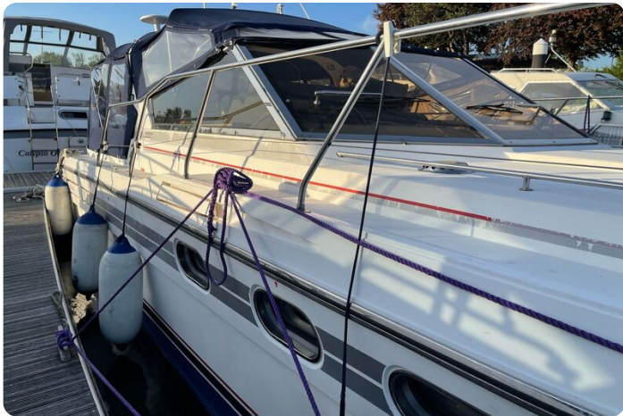
Princess 36 Riviera-lines