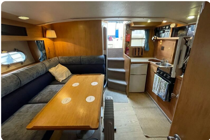
Princess 36 Riviera-saloon-seating