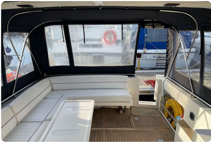
Princess 36 Riviera-seating