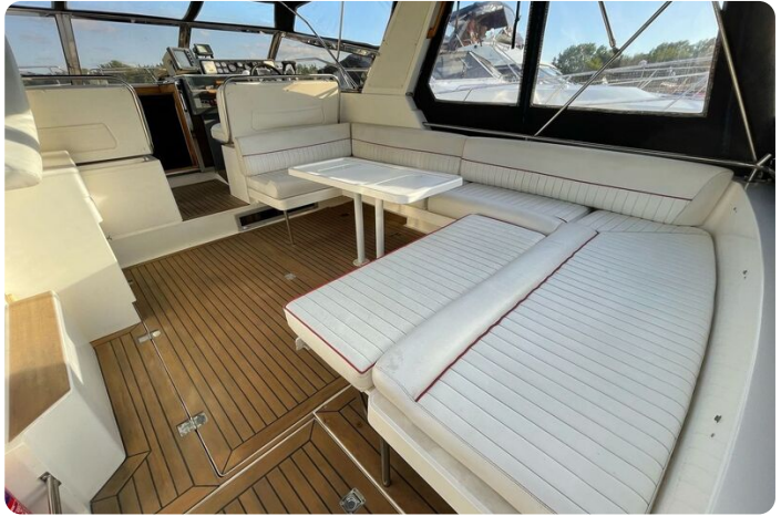
Princess 36 Riviera-Cockpit