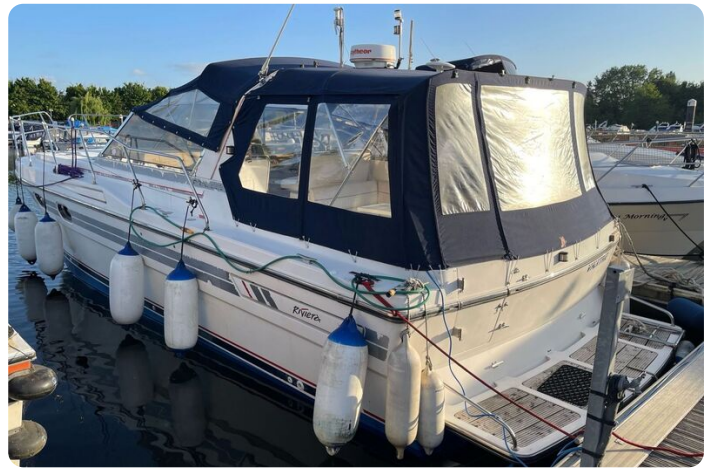
Princess 36 Riviera-stern