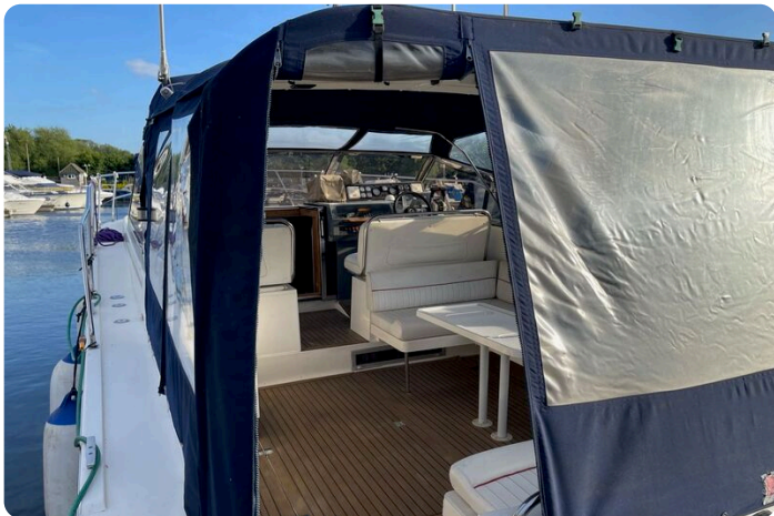
Princess 36 Riviera-canopy