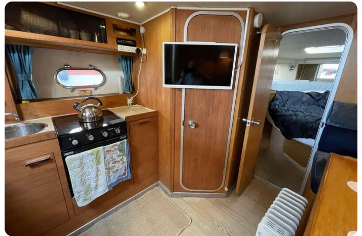
Princess 36 Riviera-tv