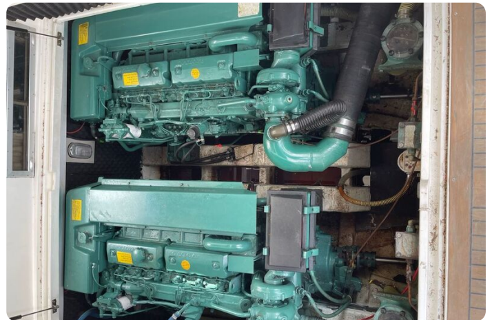
Princess 36 Riviera-engine