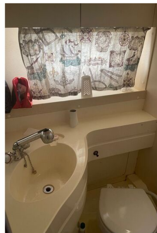
Princess 36 Riviera-toilet