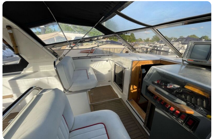
Princess 36 Riviera-co-pilot-seating