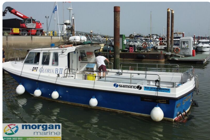
Procharter 36 GRP charter fishing boat - in the cockpit