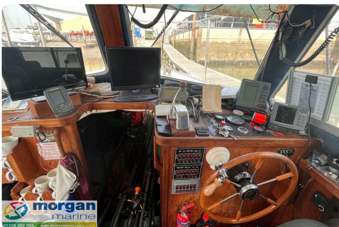
Procharter 36 GRP charter fishing boat - wheelhouse interior