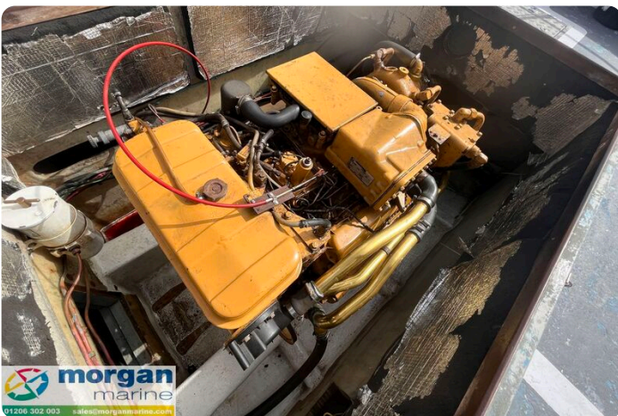
Procharter 36 GRP charter fishing boat - Caterpillar 380hp diesel shaft drive