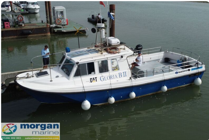
Procharter 36 GRP charter fishing boat - port side overhead view