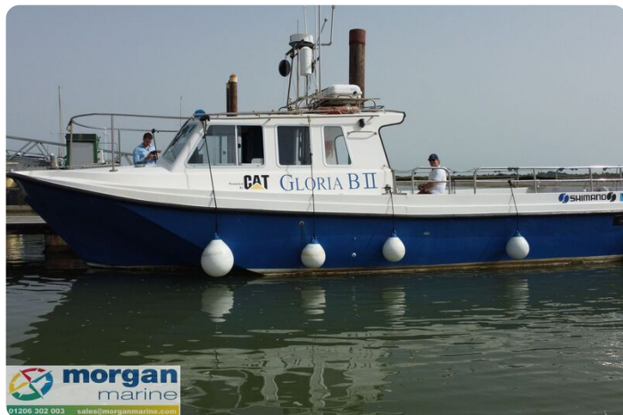
Procharter 36 GRP charter fishing boat - port side view of wheelhouse