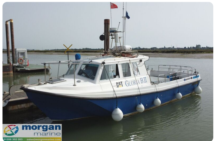
Procharter 36 GRP charter fishing boat