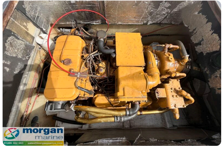
Procharter 36 GRP charter fishing boat - Caterpillar 380hp diesel shaft drive - overhead view