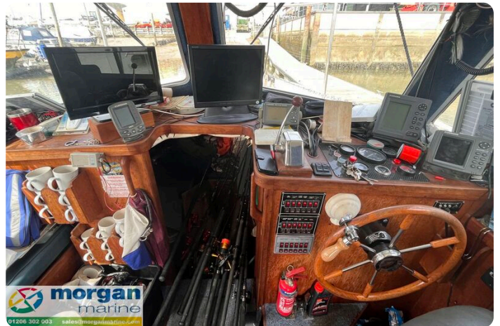
Procharter 36 GRP charter fishing boat - dash and engine controls