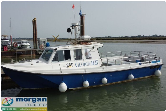
Procharter 36 GRP charter fishing boat - plenty of fenders