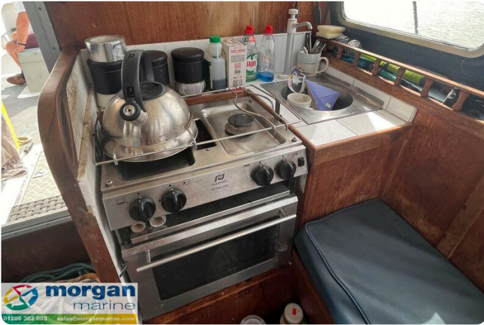
Procharter 36 GRP charter fishing boat - galley with cooker and sink