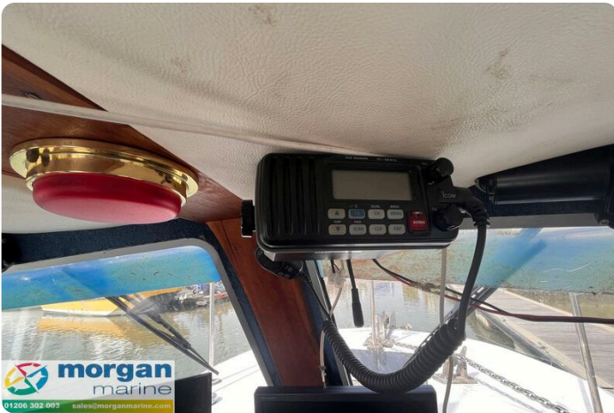
Procharter 36 GRP charter fishing boat - VHF radio