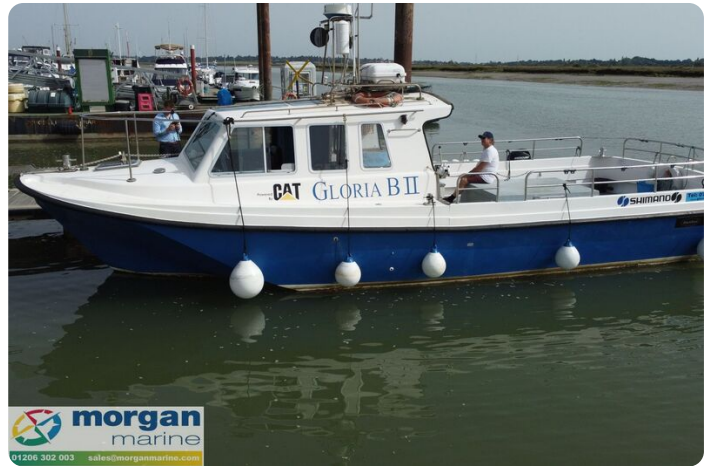
Procharter 36 GRP charter fishing boat - port side