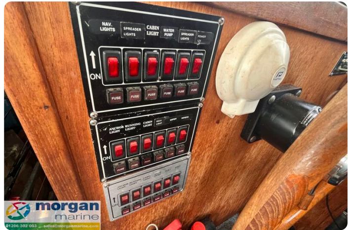
Procharter 36 GRP charter fishing boat - switch panel