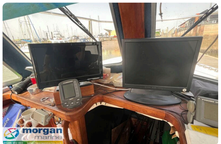
Procharter 36 GRP charter fishing boat - large screens