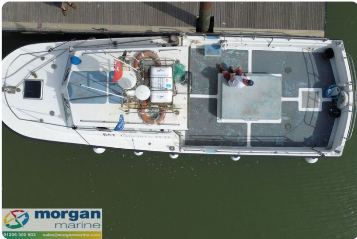
Procharter 36 GRP charter fishing boat - overhead view