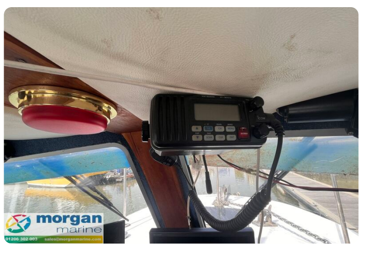
Procharter 36 GRP charter fishing boat - VHF radio