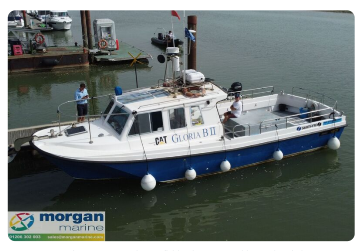
Procharter 36 GRP charter fishing boat - port side overhead view \,