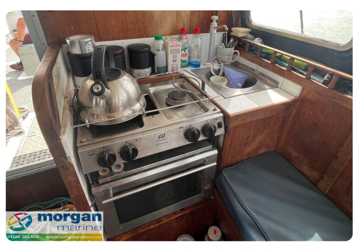
Procharter 36 GRP charter fishing boat - galley with cooker and sink