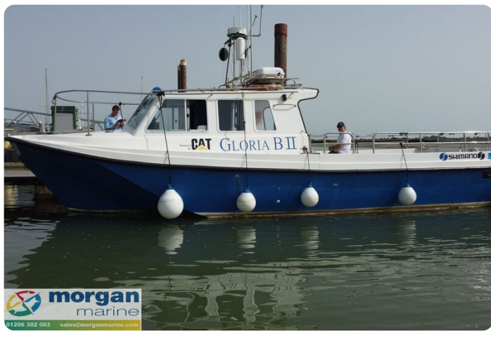
Procharter 36 GRP charter fishing boat - port side view of wheelhouse