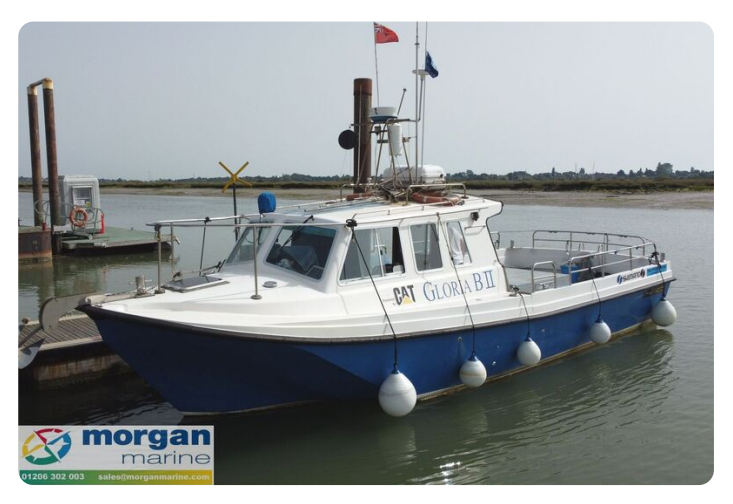
Procharter 36 GRP charter fishing boat