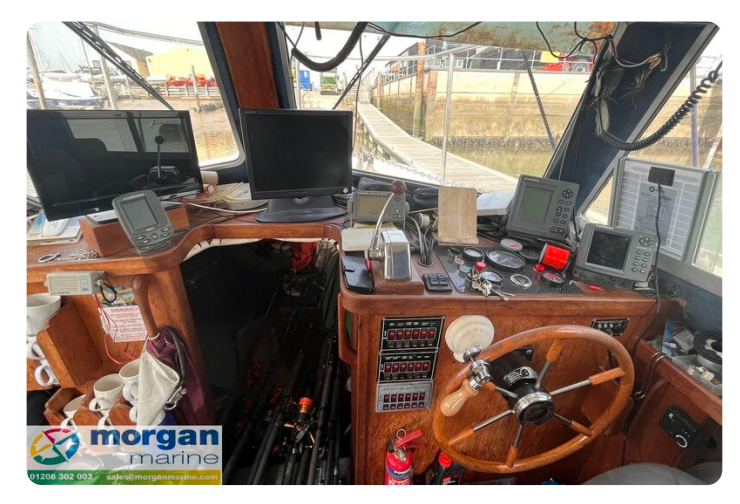
Procharter 36 GRP charter fishing boat - wheelhouse interior \,