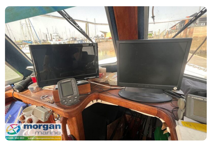
Procharter 36 GRP charter fishing boat - large screens