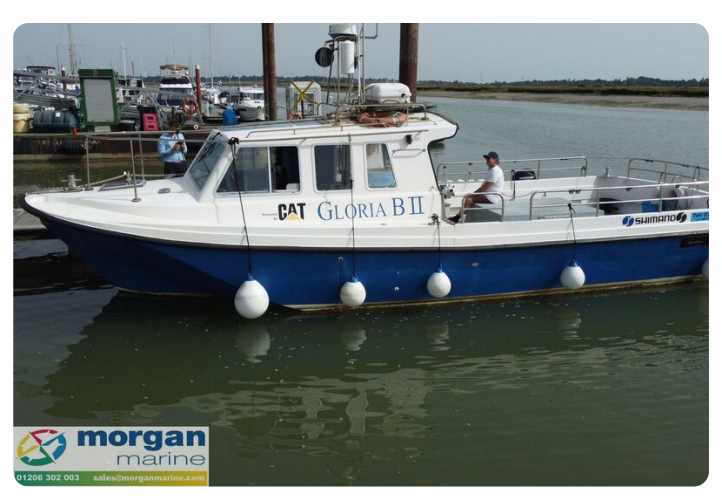
Procharter 36 GRP charter fishing boat - port side