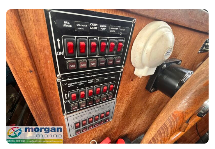
Procharter 36 GRP charter fishing boat - switch panel