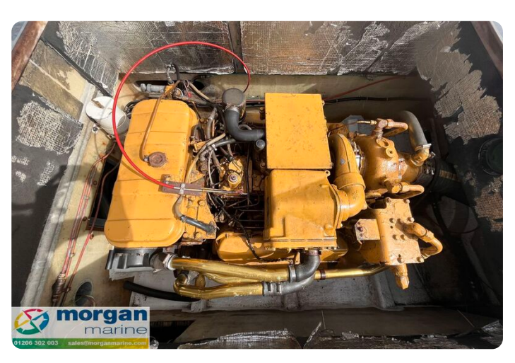
Procharter 36 GRP charter fishing boat - Caterpillar 380hp diesel shaft drive - overhead view