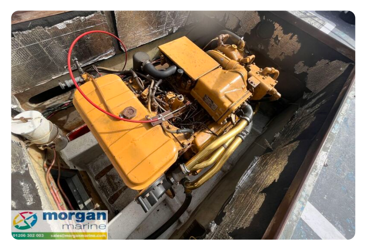
Procharter 36 GRP charter fishing boat - Caterpillar 380hp diesel shaft drive