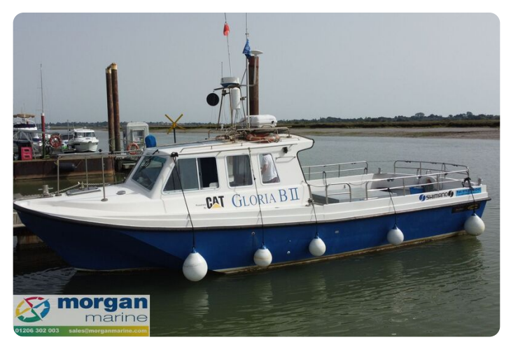
Procharter 36 GRP charter fishing boat - plenty of fenders