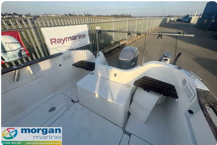
Quicksliver 640 - lockers