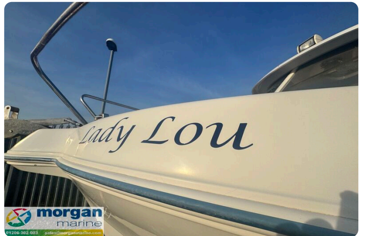
Quicksilver 640 - name