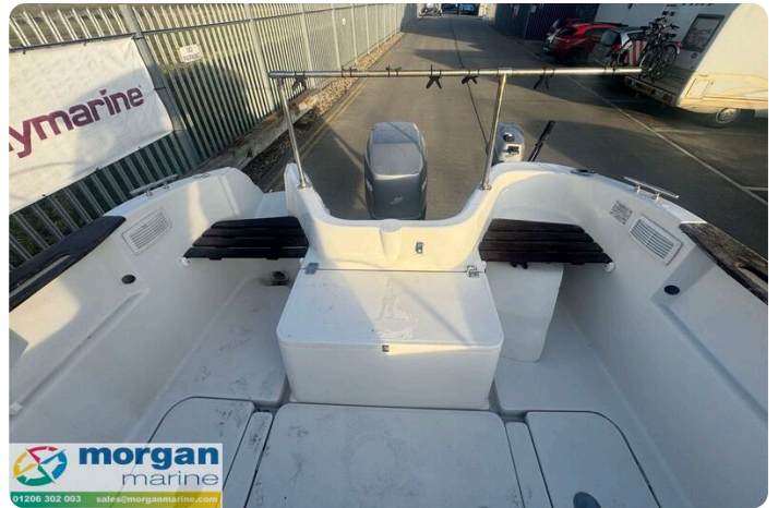
Quicksliver 640 - fishing