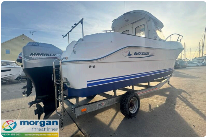
Quicksliver 640 - ladder