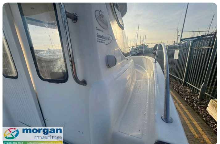
Quicksliver 640 - side walk