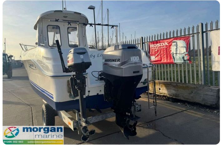
QuickSilver 640 - engine