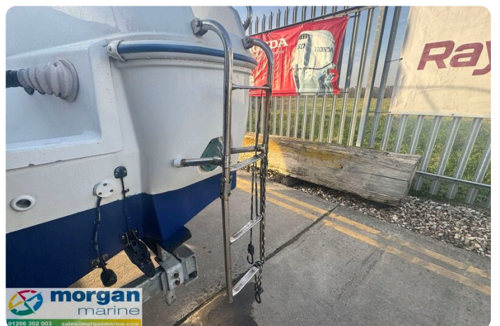
Quicksilver 640 - ladder