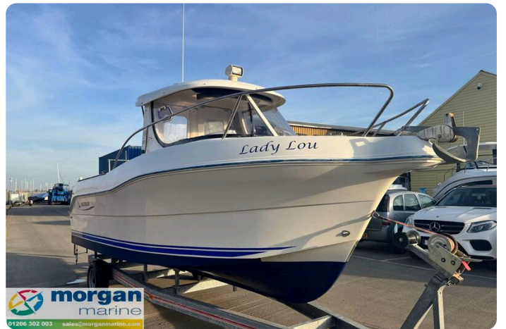
QuickSilver 640 - name