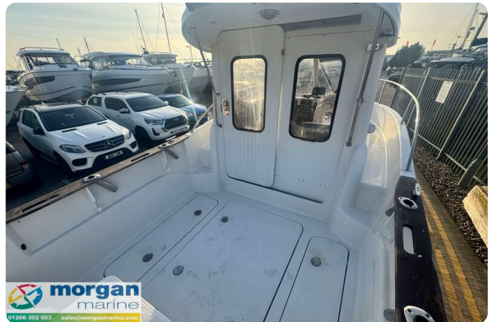
Quicksliver 640 - deck