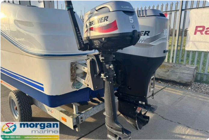
QuickSilver 640 - engine