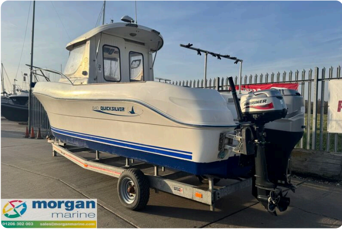
QuickSilver 640 - polished