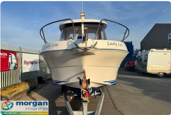
QuickSilver 640 - bow