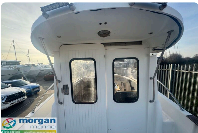
Quicksliver 640 - doors