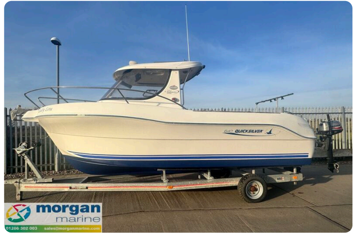
QuickSilver 640 - side