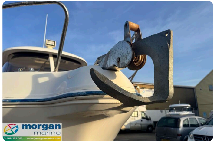
Quicksilver 640 - anchor