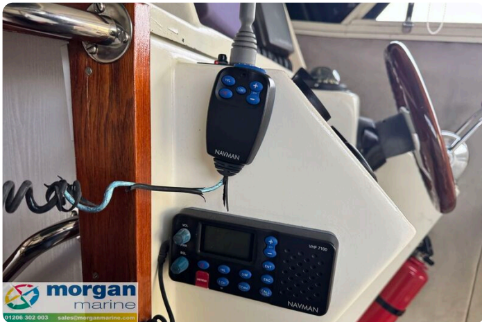
Relcraft Diamond Sedan 30 - vhf radio