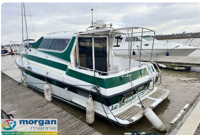
Relcraft Diamond Sedan 30 - fenders