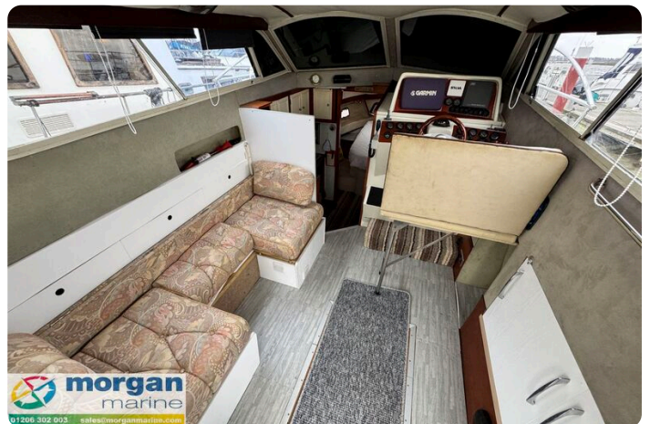
Relcraft Diamond Sedan 30 - saloon