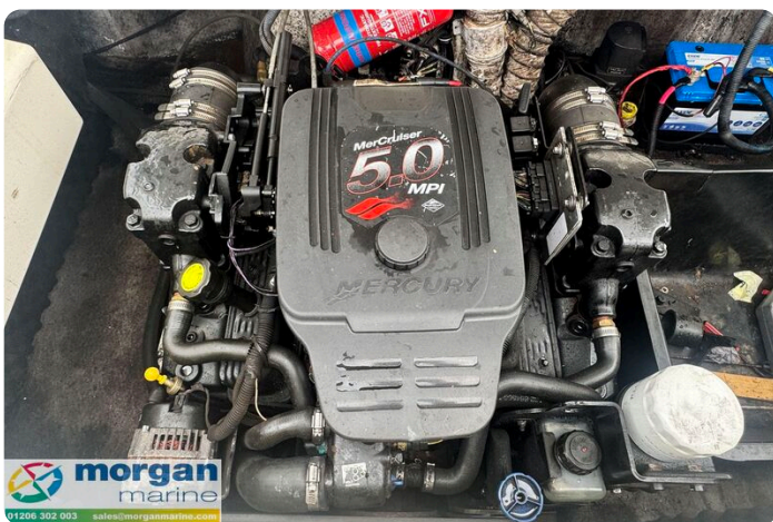
Rinker 212 bow rider - engine