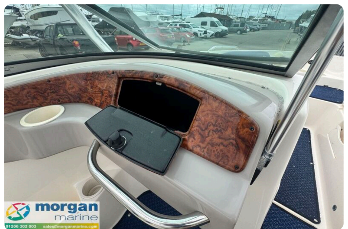
Rinker 212 bow rider - storage