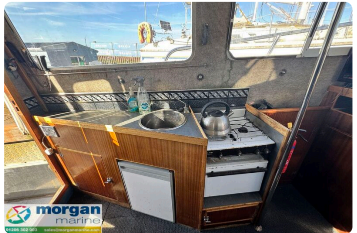
Starfish 8 - cooker