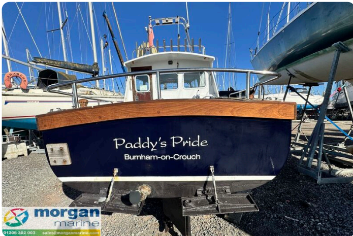
Starfish 8 - stern