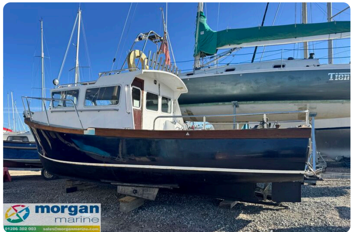
Starfish 8 - back