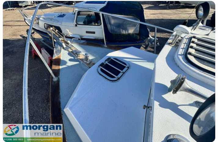
Starfish 8 - hatch