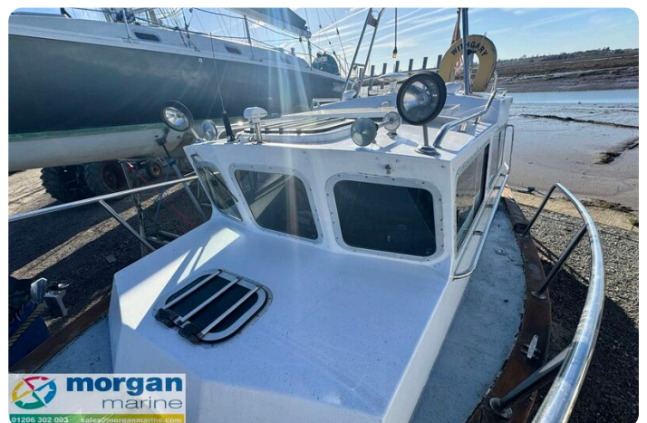
Starfish 8 - windows