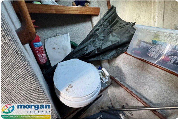
Starfish 8 - toilet