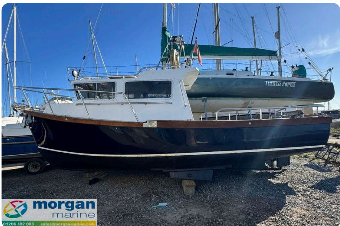
Starfish 8 - railings