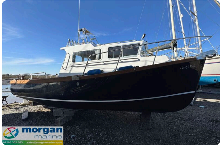
Starfish 8 - side view