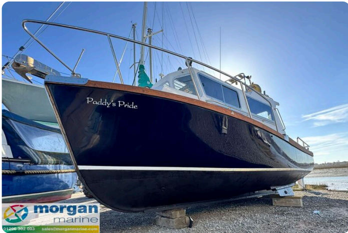
Starfish 8 - Main