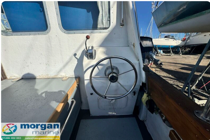
Starfish 8 - wheel