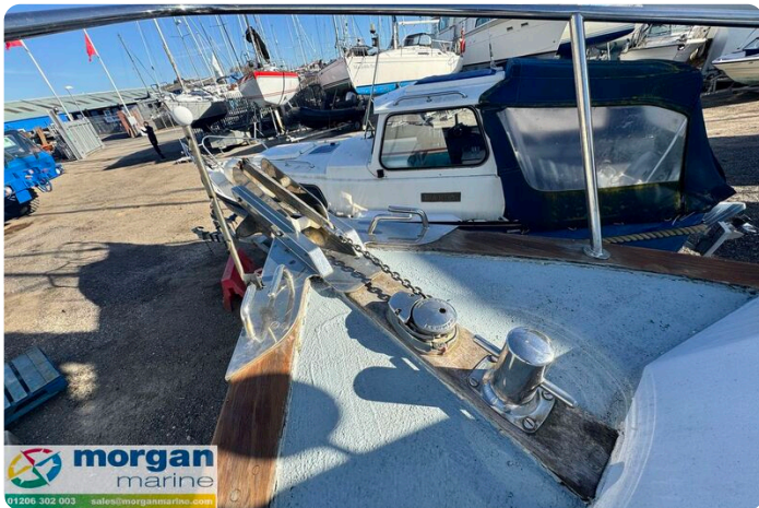
Starfish 8 - windlass