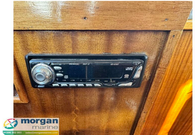
Starfish 8 - radio