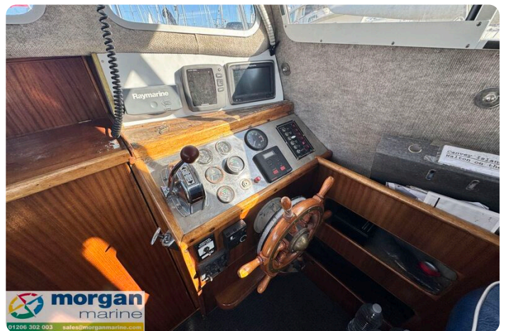
Starfish 8 - dash