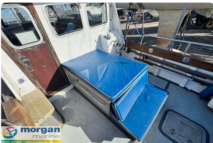
Starfish 8 - engine lid seating