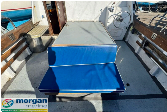
Starfish 8 - cushions