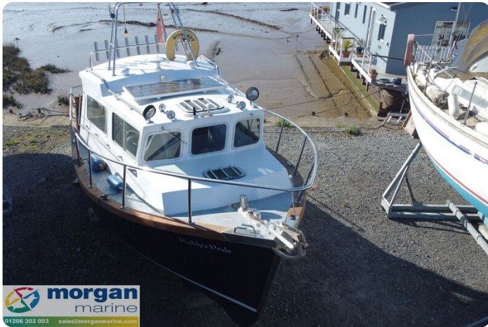
Starfish 8 - anchor