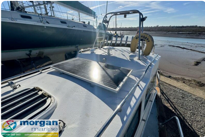
Starfish 8 - roof