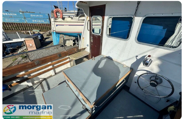
Starfish 8 - engine lids