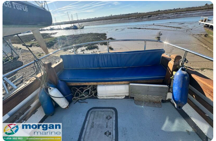
Starfish 8 - seating