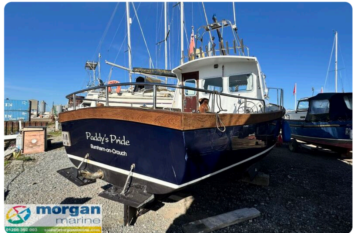
Starfish 8 - stern 1