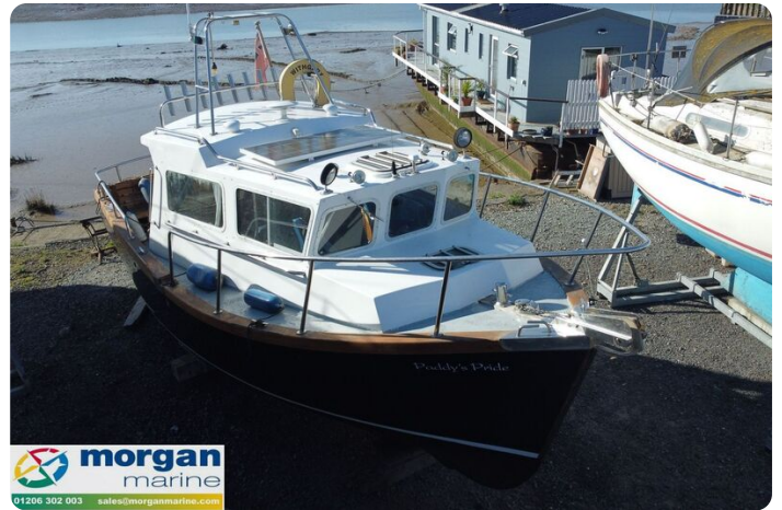
Starfish 8 - deck