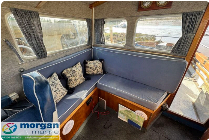
Starfish 8 - saloon seating