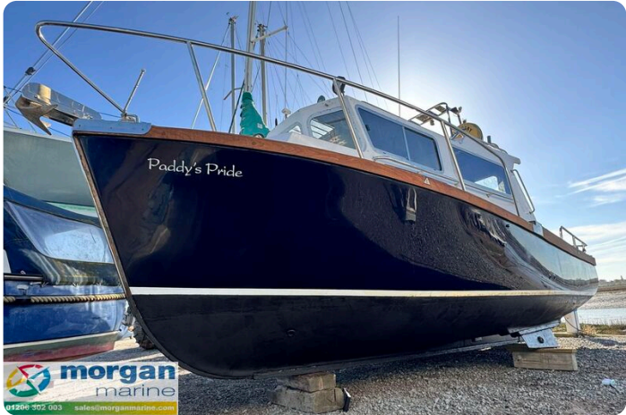
Starfish 8 - side view