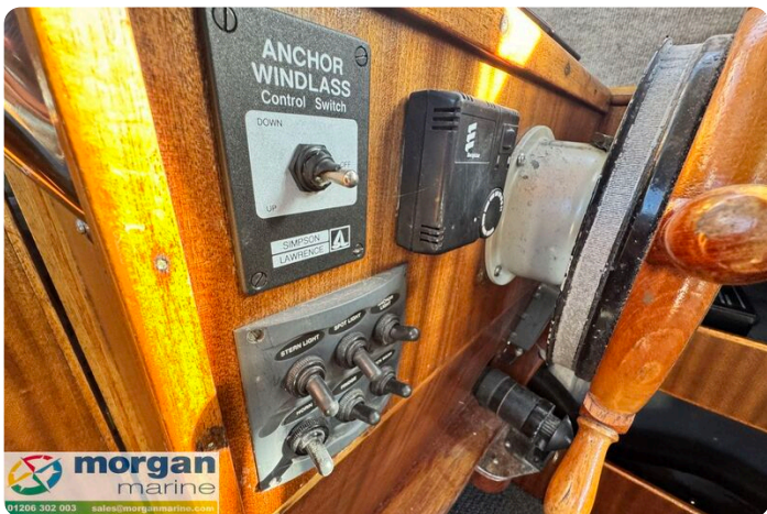
Starfish 8 - windlass control