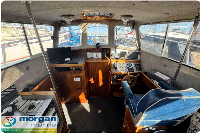
Starfish 8 - saloon 2