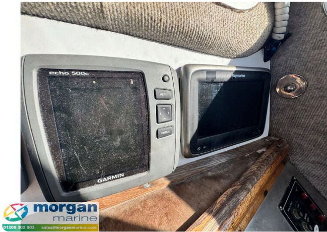
Starfish 8 - plotter