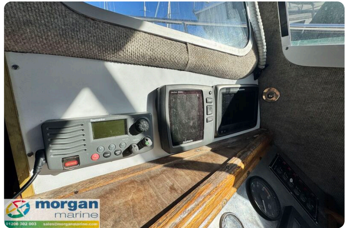
Starfish 8 -electronics