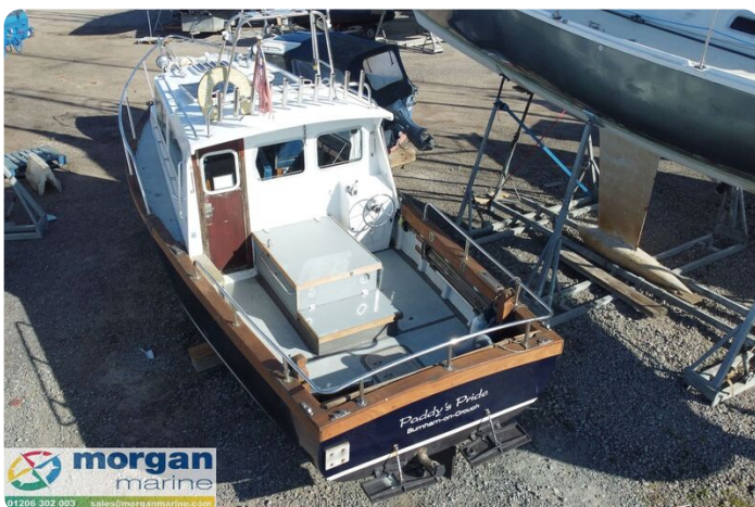
Starfish 8 - top view