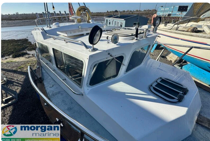
Starfish 8 - roof