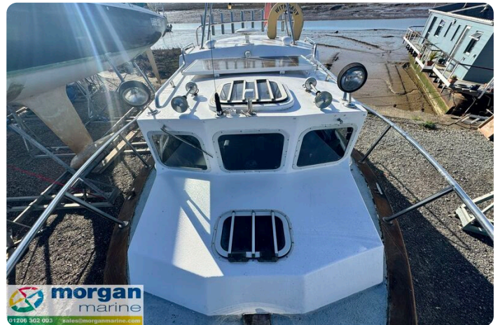
Starfish 8 - top view