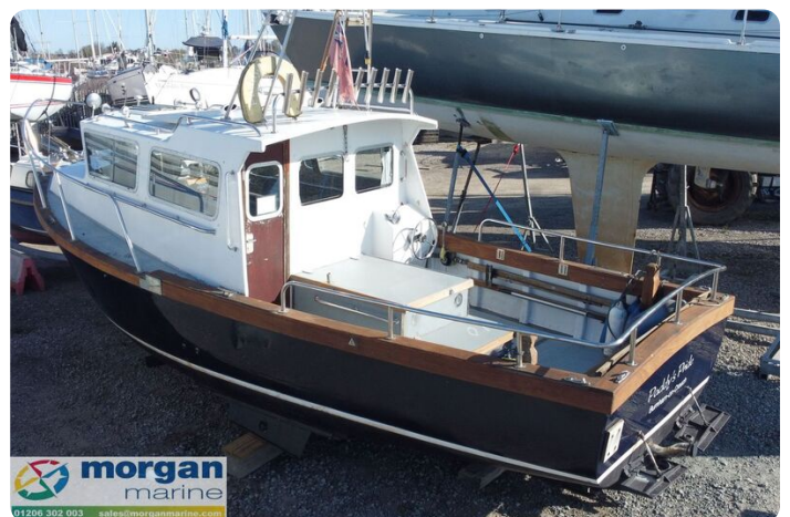
Starfish 8 - back