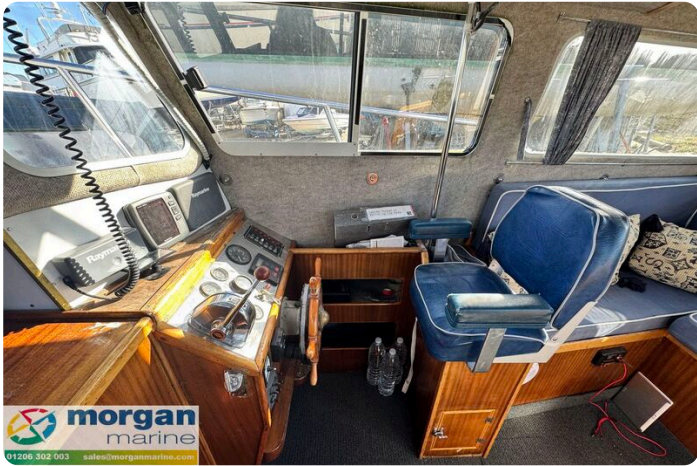
Starfish 8 - pilot seat