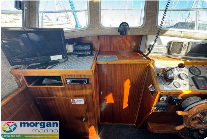
Starfish 8 - cabin