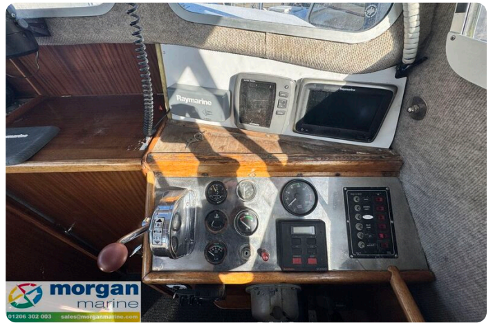
Starfish 8 - plotter