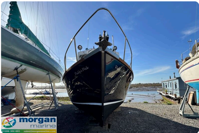
Starfish 8 - main view