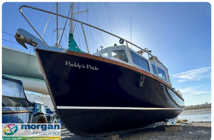
Starfish 8 - hull