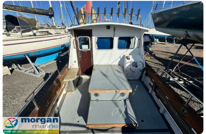
Starfish 8 - cockpit