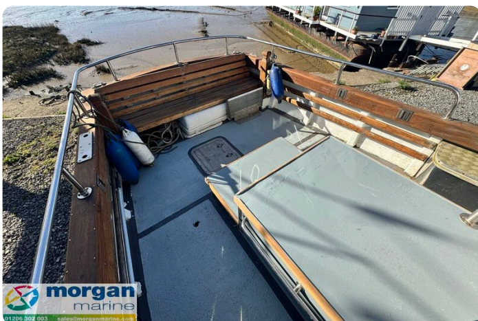
Starfish 8 - deck