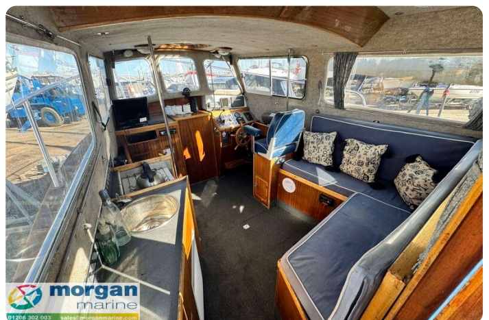
Starfish 8 - saloon