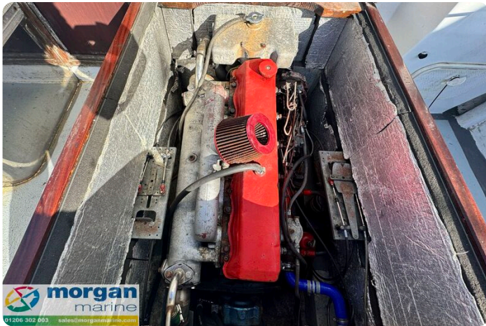
Starfish 8 - engine