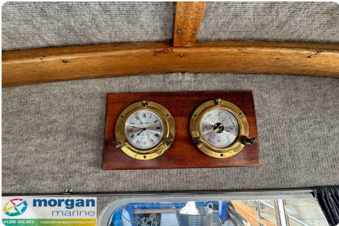
Starfish 8 - clocks