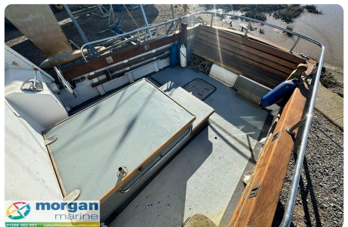
Starfish 8 - engine lid