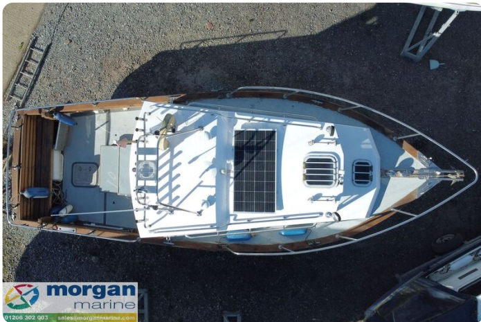
Starfish 8 - solar panel