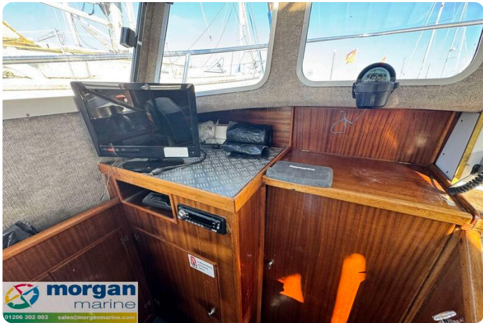
Starfish 8 - fm radio