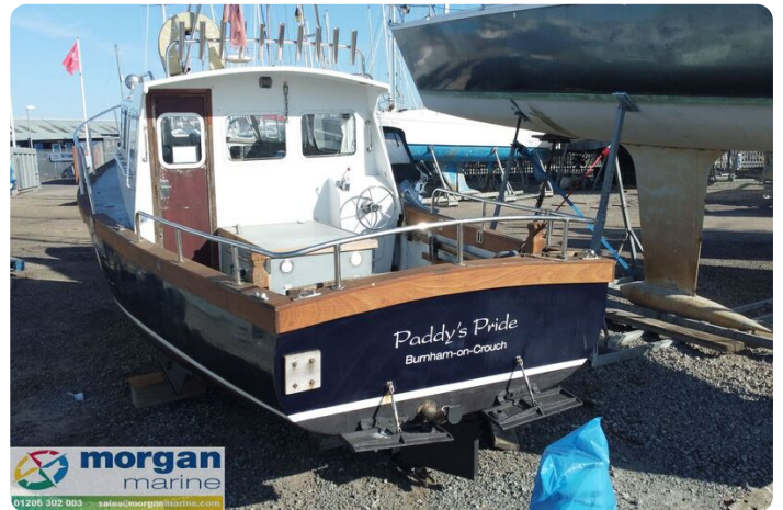
Starfish 8 - back