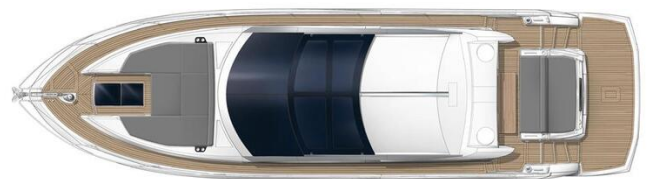
PRE50 upper deck