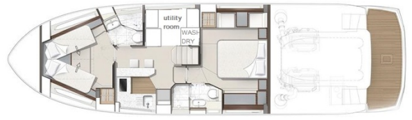
PRED50 lower deck w. utility room