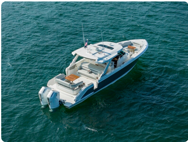
Tiara 43LS aerial