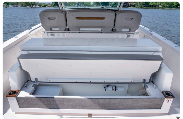
Tiara 43 LS aft storage