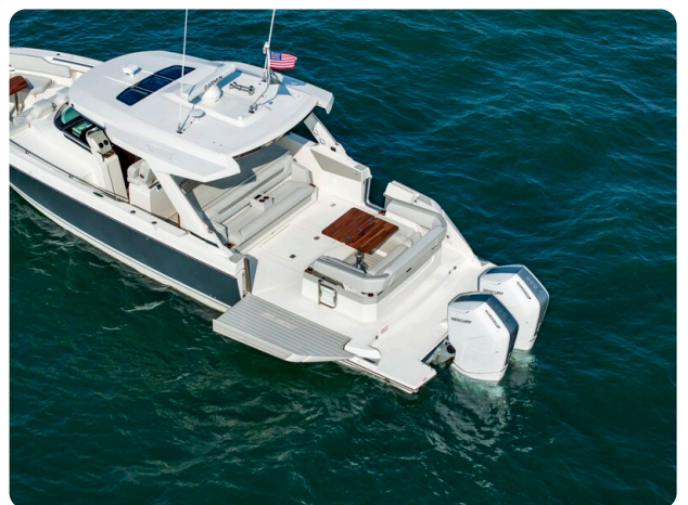
Tiara 43LS terrace detail