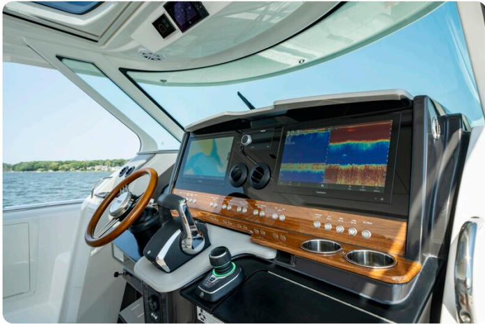
Tiara 43LS helm station