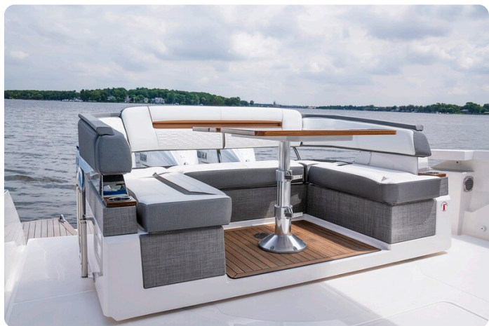
Tiara 43 LS aft dinette