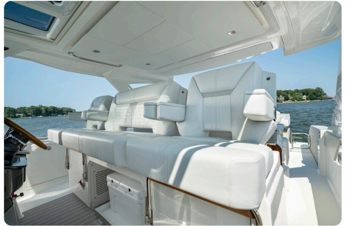
Tiara 43LS helm seats