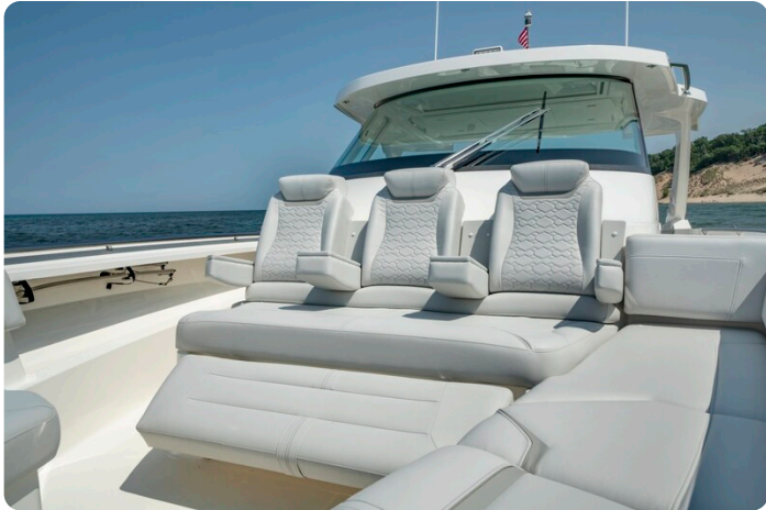
Tiara 43LS fwd seats