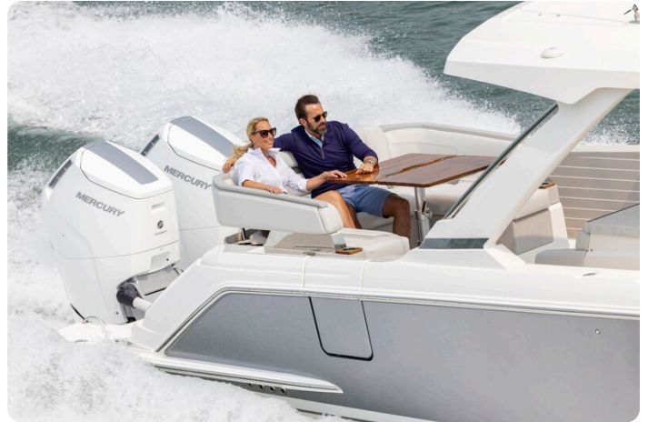
Tiara 43LS details