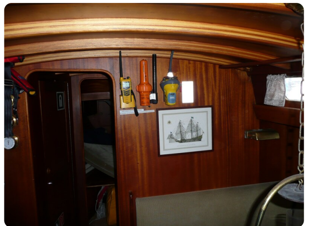
Vindö 50 msp269542 11